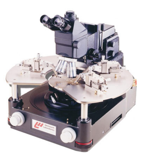
PVX 500 manipulators with Wentworth's PML 8000 analytical prober